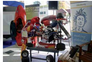
Pitstop 2000 Ltd - 2007 Dragons' Den Competition Winners

Footsey 2008 is only a couple of weeks away, and looks set to be as exciting and action packed as ever. Already two thirds of the exhibition spaces have been firmly booked, so if you intend to exhibit you need to confirm your interest soon (full details at http://www.footsey.org.uk or call Chloe Gray on 0114 221 0428). Numbers of delegates are also much higher this year promising a lively and engaging event.